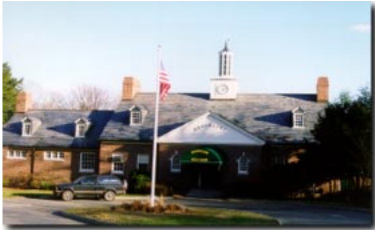
View of Exterior