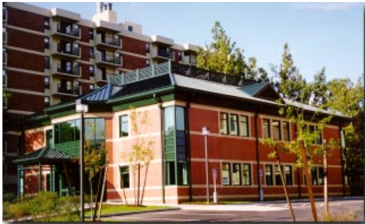
View of Exterior