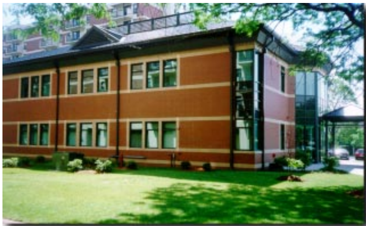
View of Exterior