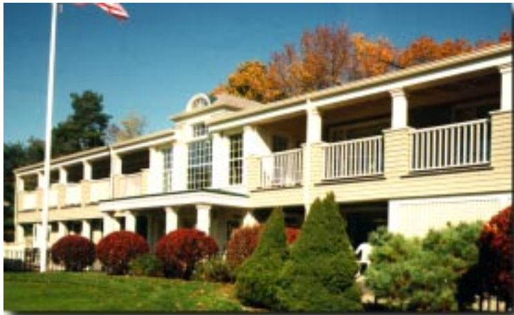
View of Exterior